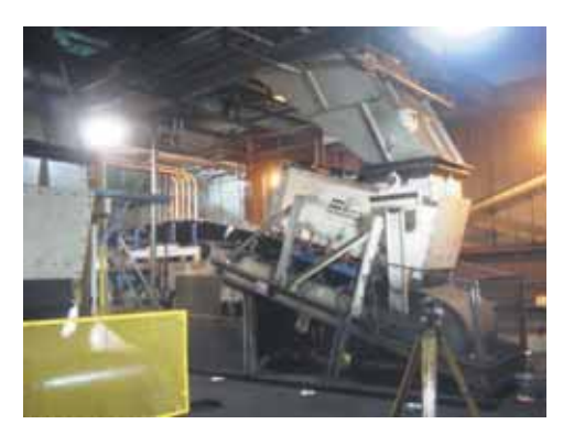
The Martin® Inertial Flow™ Transfer has doubled the material flow rate while reducing the dust level by over 98%.