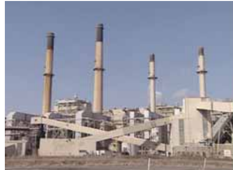
The AmerenUE Meramec plant is a four-unit, 865MW facility fired with PRB coal.

LOCATION: AmerenUE Meramec Plant St. Louis, Missouri (South, on the Mississippi River)