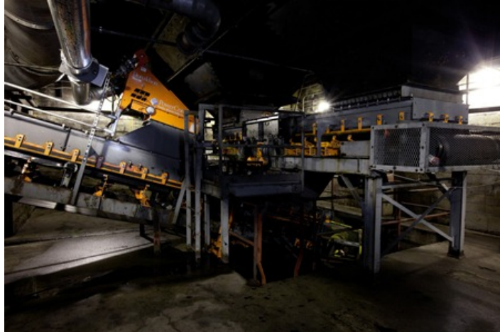
Insertable Air Cleaners were added to 10 load zones to further reduce the escape of fugitive material.

The filter material is also impregnated with carbon fibers to dissipate any buildup static electricity. This weave of carbon fibers allow any built-up charge to be instantly grounded out of the filters. The carbon impregnation allows the filters to have a total resistance of less than 10^8 ohms, tested per ESD STM 11.11-2001. As a charge cannot