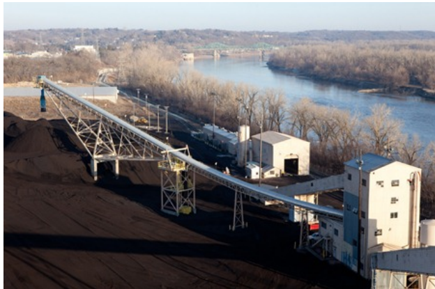
Omaha Public Power District (OPPD) in Omaha NE.

OPPD was using a conventional, dated materials handling system. Martin was asked to conduct a safety and materials handling audit specifically addressing fugitive dust and overall coal dust control. This audit revealed some opportunities to upgrade conveyors that would maximize safety, while also addressing the coal dust concerns.