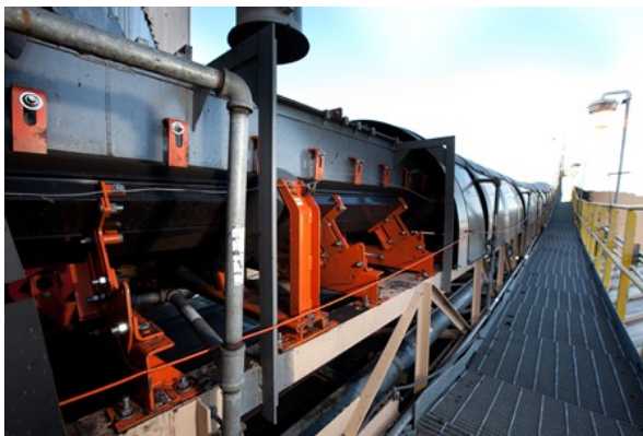
Transfer point upgrades aimed at combustible dust mediation were needed to improve the overall safety of the plant.

The new Martin dust collectors have allowed the North Omaha Station to become safer “because now that we can use the smaller Martin products, we can shut down the older, larger dust collector that has a history of explosion hazards. The little ones don’t contain, capture or store large amounts of fuel. They just have a few ounces of coal in them at any time, and they’re always purging and cleaning themselves. From a safety standpoint, that’s why they’re great,” said Estee.