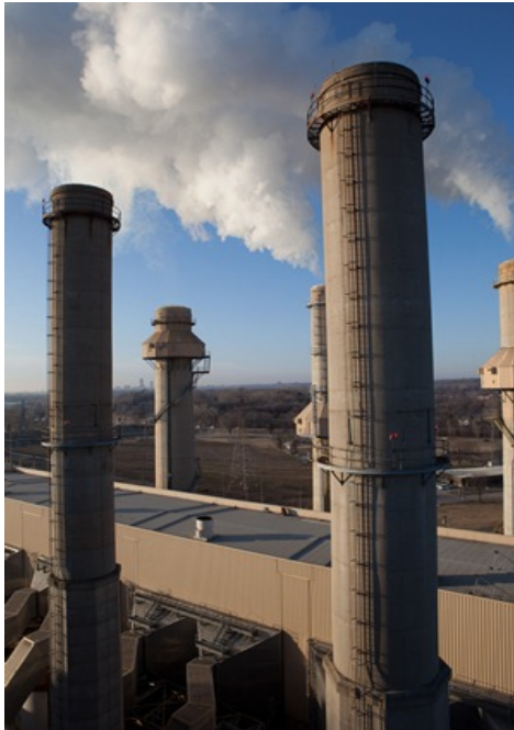
Omaha Public Power District (OPPD) is one of the largest publicly owned electric utilities in the US, located north of the city along the Missouri River.

[Omaha, NE] – The Omaha Public Power District (OPPD) employs 2,300 people and operates over 15,500 miles of electric transmission and distribution lines in Nebraska. OPPD is one of the largest publicly owned electric utilities in the United States, serving more than 350,000 customers in 13 southeast Nebraska counties. Organized as a political subdivision of the State of Nebraska in 1946, today OPPD has a generating capacity of over 3,200 Megawatts, almost half of which is generated from coal. OPPD does have fuel diversity with other generation from nuclear, natural gas, wind and landfill gas.