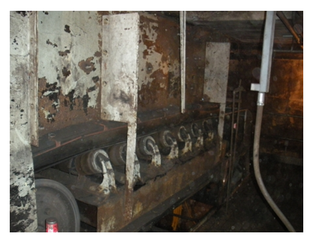
NIPSCO before: MCGS took a proactive approach to upgrading conveyor feed systems, conducting a plant-wide assessment and implementing a program designed to reduce fugitive dust and spillage.