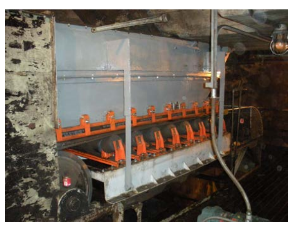
NIPSCO after: The EVO<sup>™</sup> External Wear Liner is designed to remove the material burden from the dust containment system, diverting the bulk of the load away from the sealing components and extending their service life.

Efficient material flow is a critical element of dry bulk handling, and fugitive material accumulation can have a significant effect on a plant's profitability. Spillage around conveyors and transfer chutes is a waste of material, typically requiring labor-intensive cleanup that raises maintenance expenses and diverts manpower from core activities, in some cases introducing safety risks for personnel. Although many plants still use manual techniques to remove accumulation, the cost of labor and periodic shutdowns has led some producers to investigate more efficient methods for dealing with this common issue.