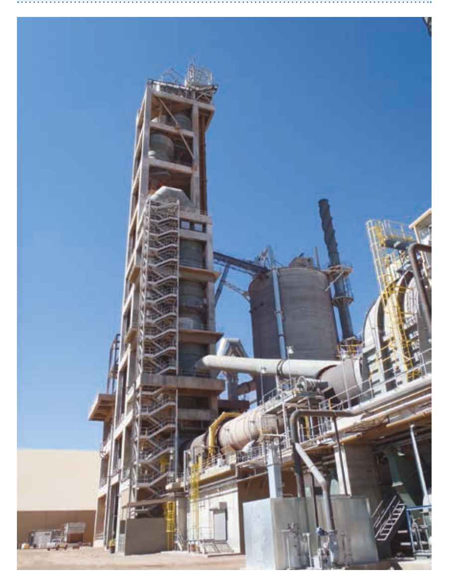
The original cannons were located in the entry to the kiln, cooler inlet and the preheater tower.

positive-acting valve amplifies the discharge, providing up to 20% more force than a standard air cannon of the same size. In addition, the improved air path of the Tornado fills the reservoir 3 - 4 times faster than typical designs.